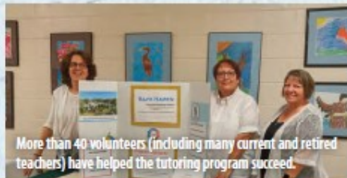
More than 40 volunteers (including many current and retired teachers) have helped the tutoring program succeed.

Every dollar and dime dropped in a basket, envelope or jar—or given online—matters to Presbyterian Women's many ministries. For example, Presbyterian Women's generous gifts to the Thank Offering in 2017 allowed PW to award a grant of $22,250 in 2018 to Safe Haven at Sea Island Presbyterian Church in Beaufort, South Carolina. Inspired by the PW/ Horizons Bible study, Come to the Waters , which suggested looking within a mile of the church for mission needs, Safe Haven was created to offer tutoring to neighborhood children, and showering and laundry facilities to people who are experiencing homelessness.