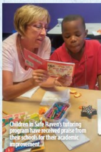
Children in Safe Haven's tutoring program have received praise from their schools for their academic improvement.