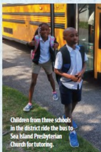
Children from three schools in the district ride the bus to Sea Island Presbyterian Church for tutoring.

Every dollar and dime dropped in a basket, envelope or jar—or given online—matters to Presbyterian Women's many ministries. For example, Presbyterian Women's generous gifts to the Thank Offering in 2017 allowed PW to award a grant of $22,250 in 2018 to Safe Haven at Sea Island Presbyterian Church in Beaufort, South Carolina. Inspired by the PW/ Horizons Bible study, Come to the Waters , which suggested looking within a mile of the church for mission needs, Safe Haven was created to offer tutoring to neighborhood children, and showering and laundry facilities to people who are experiencing homelessness.